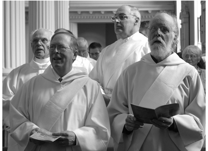
Deacons of the Diocese of Burlington were among those attending the ordinations June 16 at St. Joseph Cathedral in Burlington.

CARA, The Center for Applied Research in the Apostolate at Georgetown University, has released a new book. Word, Liturgy, Charity: The Diaconate in the U.S. Catholic Church, 1968-2018 , is a contemporary study of the diaconate in the United States.