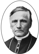
Bishop Louis deGoësbriand 1853–1899