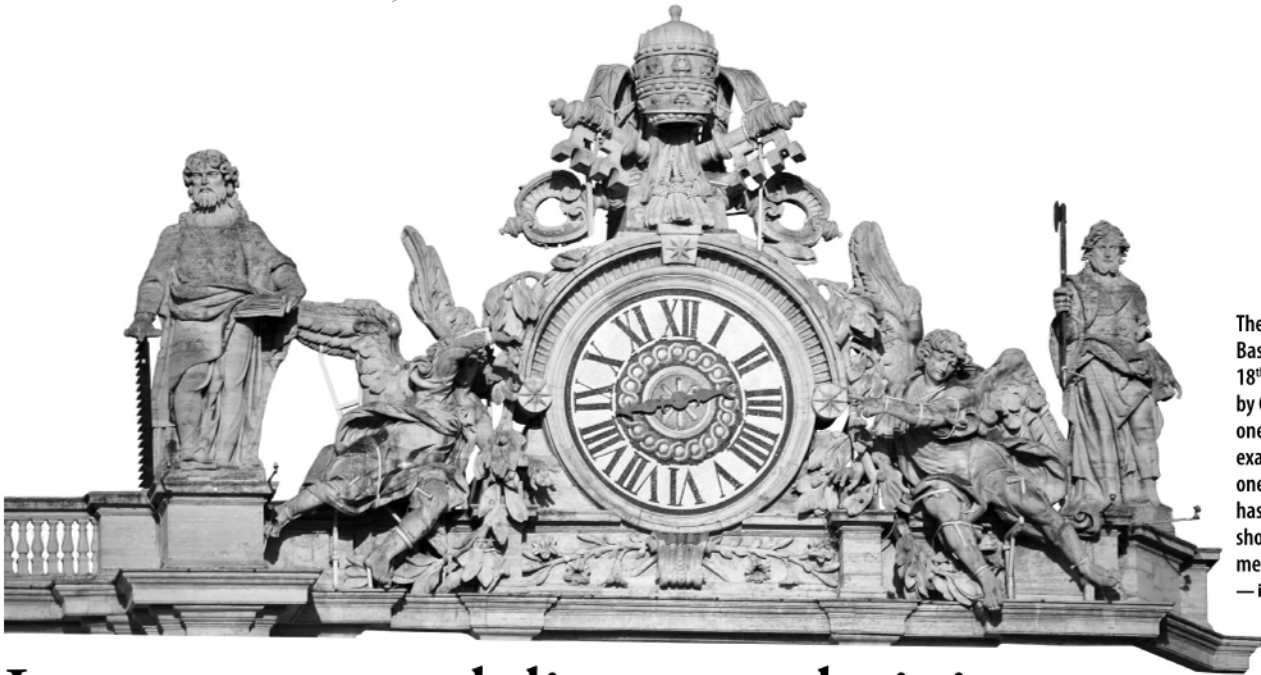
The facade of St. Peter's Basilica is flanked by two 18 th century clocks, built by Giuseppe Valadier. The one on the left shows the exact time in Rome. The one on the right (here) has a single hand, which shows the European mean time.