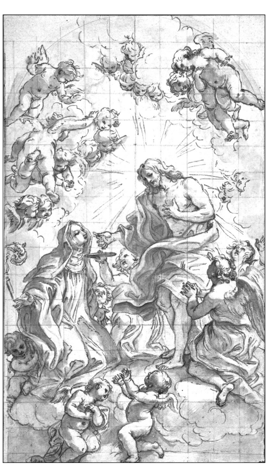
Above: "Christ Giving the Host to a Holy Abbess" pen, ink and chalk on paper, by Giovanni Battista Gaulli, 1690.